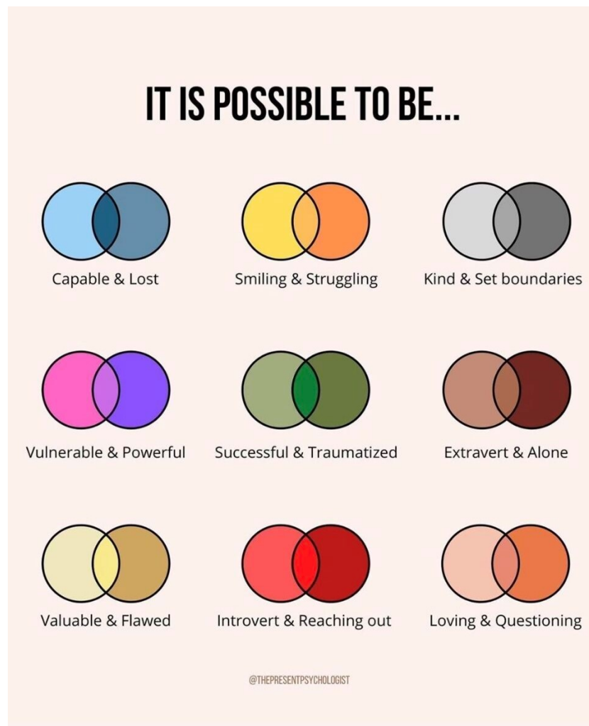
Figure 1: This beautiful post shows us the grey zones, the space in between binary thinking, where an inclusive and human approach is possible [1].