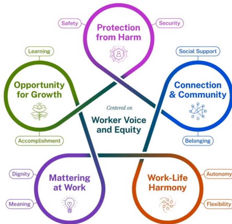
Figure 2: The U.S. Surgeon Surgeon General's Framework for Workplace Mental Health and Well-Being [2].