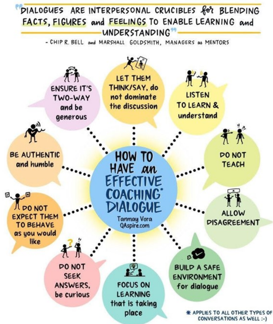
Figure 3: This post shows us that people are able to change and evolve through dialogue, besides inner dialogue as well [1].

of our planet, I mean the neutral zones of peace and exchange. Open new levels of consciousness using emotional, spiritual, or philosophical values (readings, inter-subjectivity, art practices...).