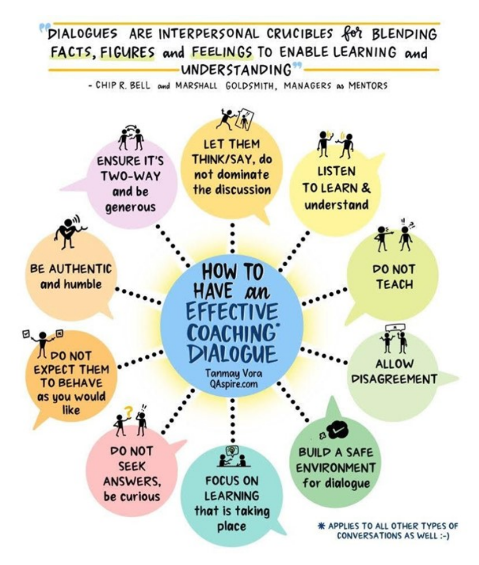
Figure 3: This post shows us that people are able to change and evolve through dialogue, besides inner dialogue as well [1].

of our planet, I mean the neutral zones of peace and exchange. Open new levels of consciousness using emotional, spiritual, or philosophical values (readings, inter-subjectivity, art practices...).