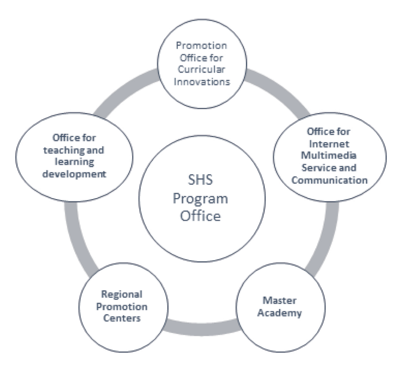
Figure 1: Organizational framework of SHS Program.